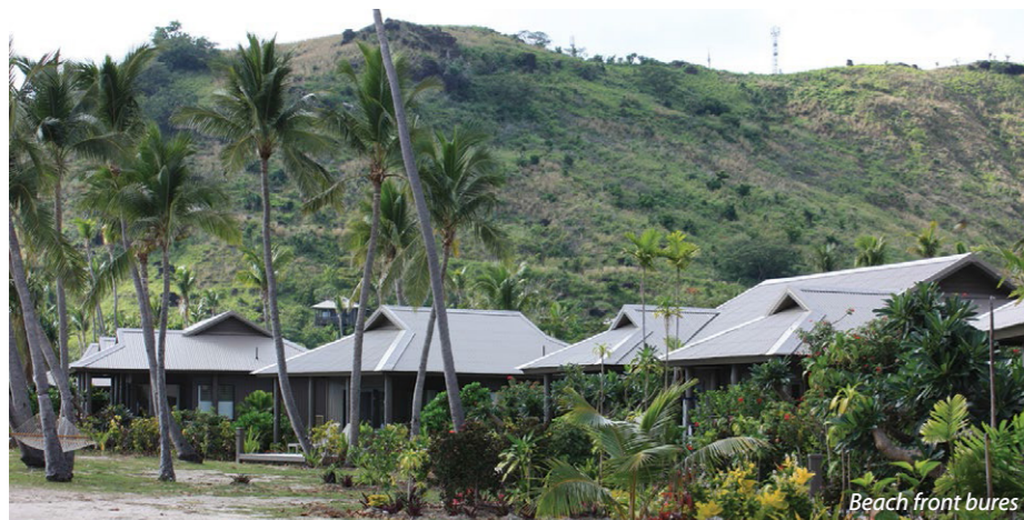
Beach front bures

A complete internal renovation of Fiji's Vomo Island Resort had just been completed when, on 22 February last year, tropical cyclone Winston hit, winds up to 350 kph ensuring the luxury, five star resort would require major restoration.