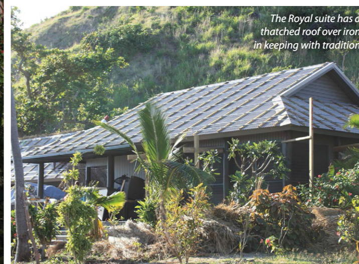
The Royal suite has a thatched roof over iron in keeping with tradition