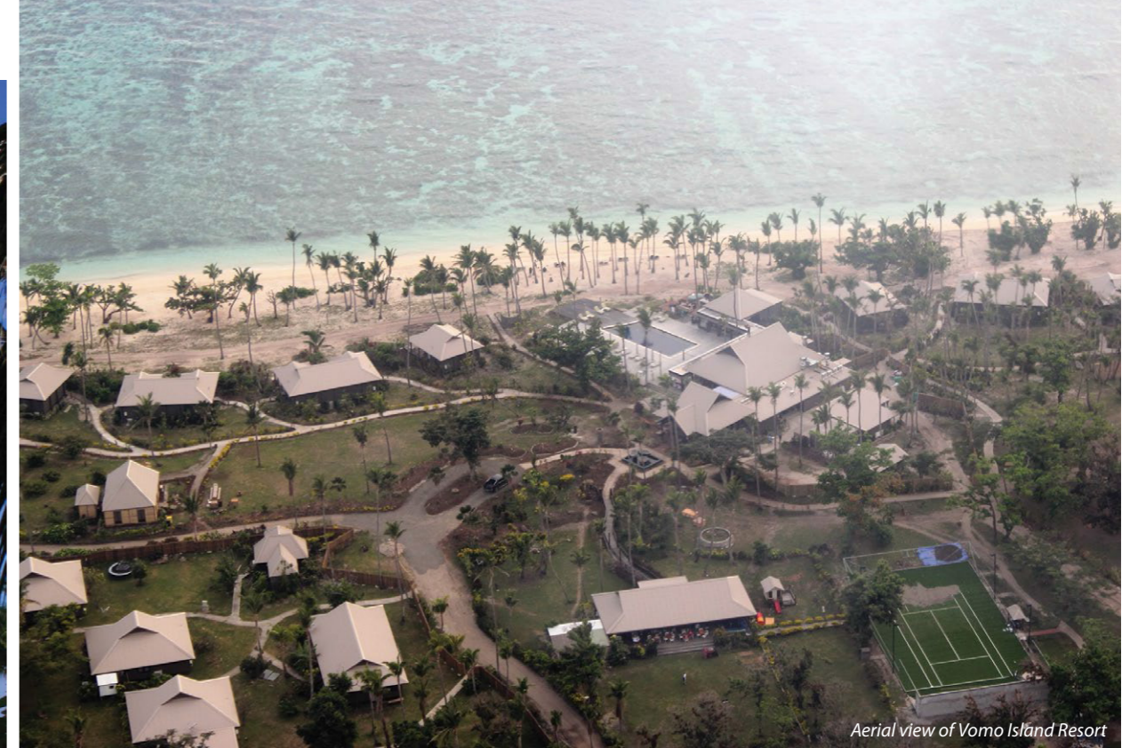
Aerial view of Vomo Island Resort